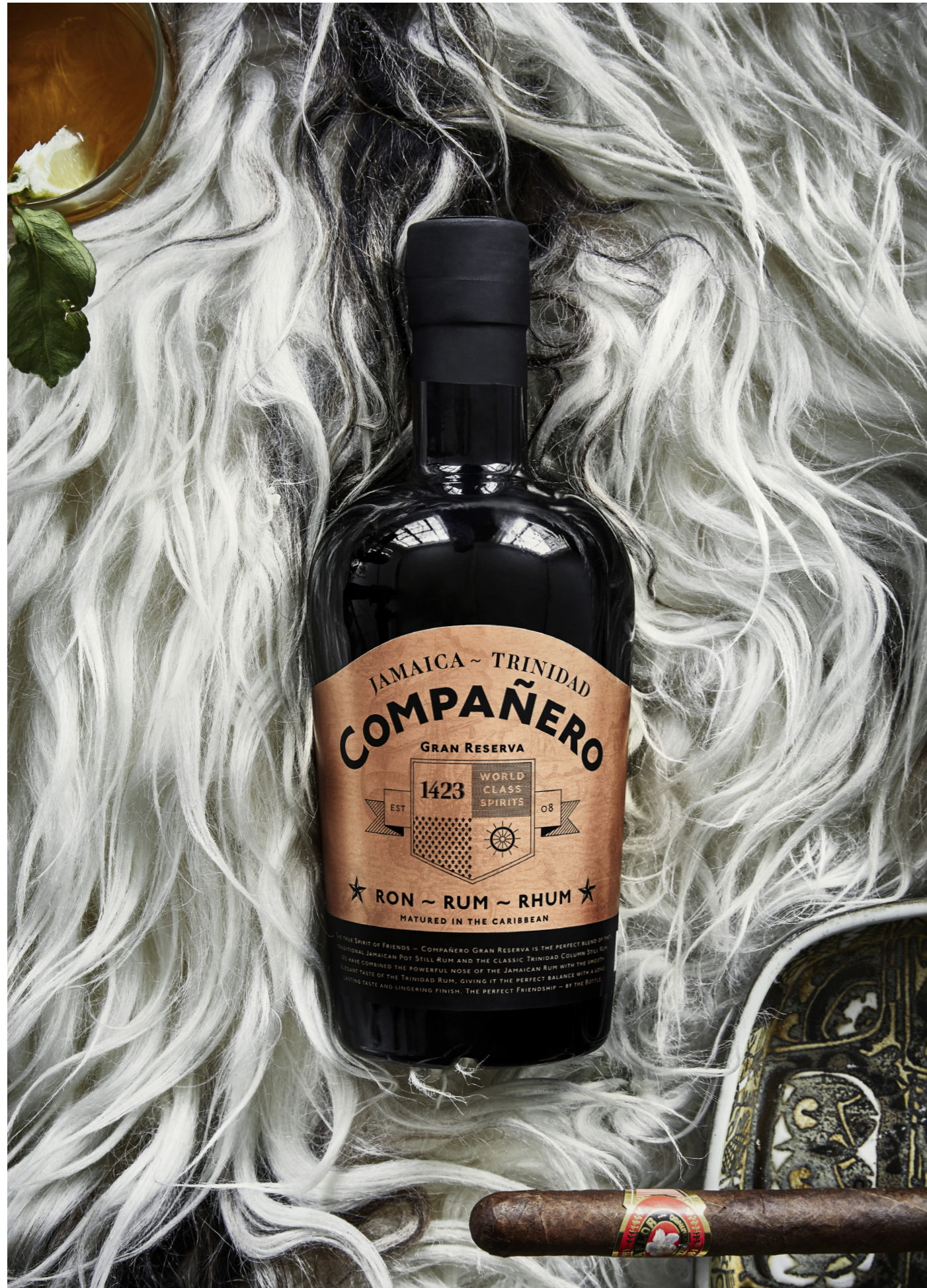
Compañero Ron Gran Reserva from 1423