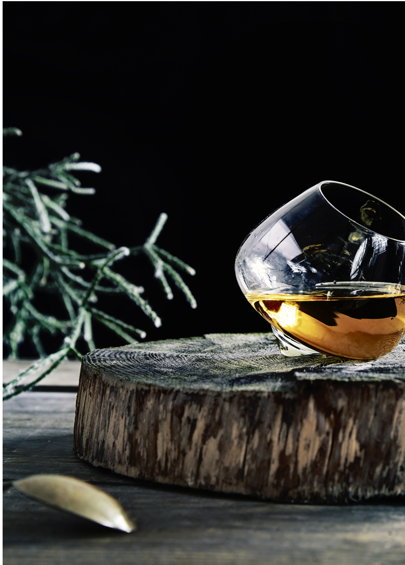
Ron Esclavo XO Cask in glass from Normann Copenhagen