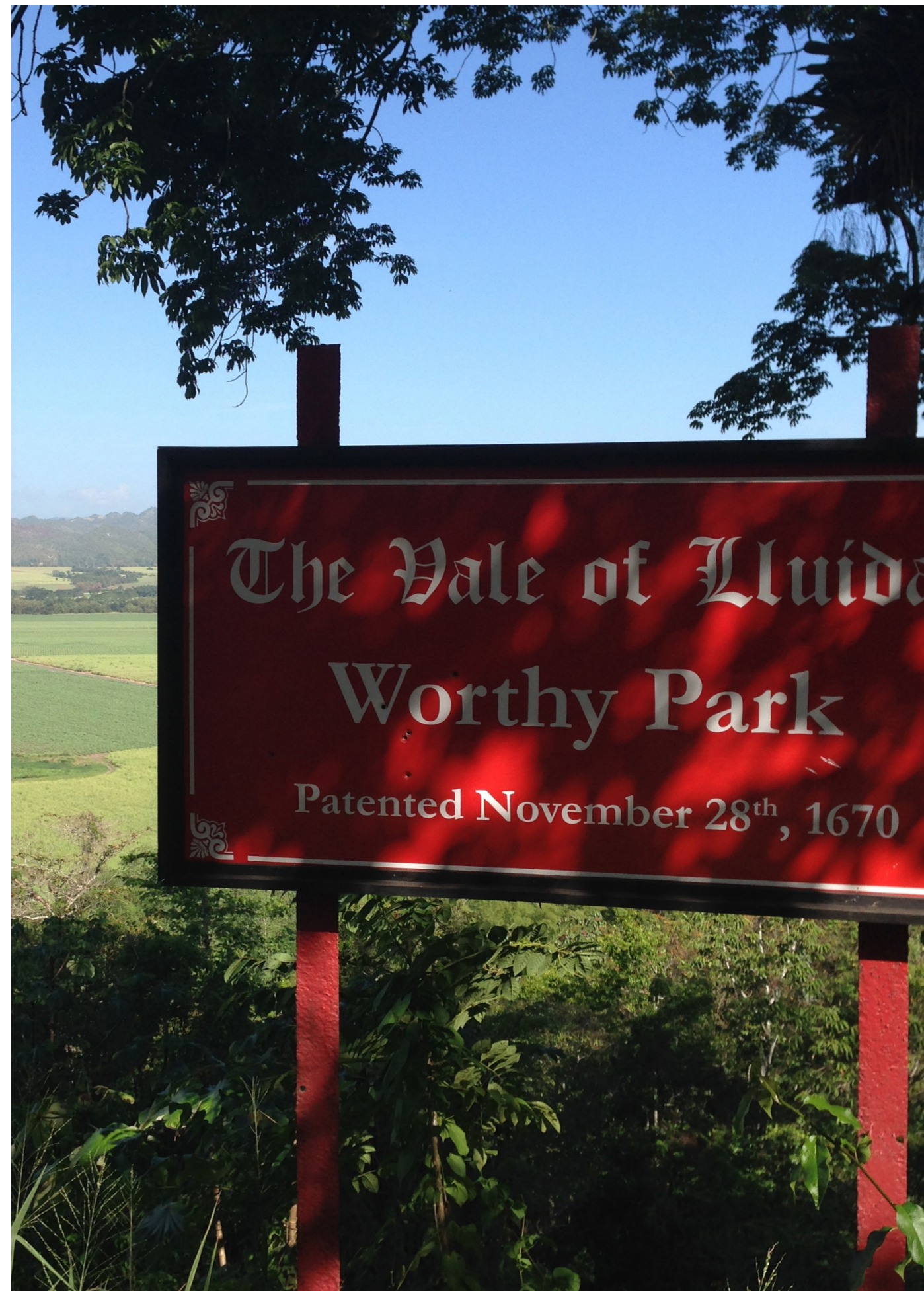
The Vale of Lluidas, Worthy Park Estate, Jamaica

After being out of the distillation business for decades, the Clarke family decided in 2004 that there was room for another Jamaican rum, made with quality ingredients in a perfect contrast by distilling in the Traditional Jamaican Pot-Still method however with efficiency and state-of-the-art equipment helping us get there. In 2005, the newest distillery was complete, and by 2007 the flagship brand Rum-Bar Rum was launched!