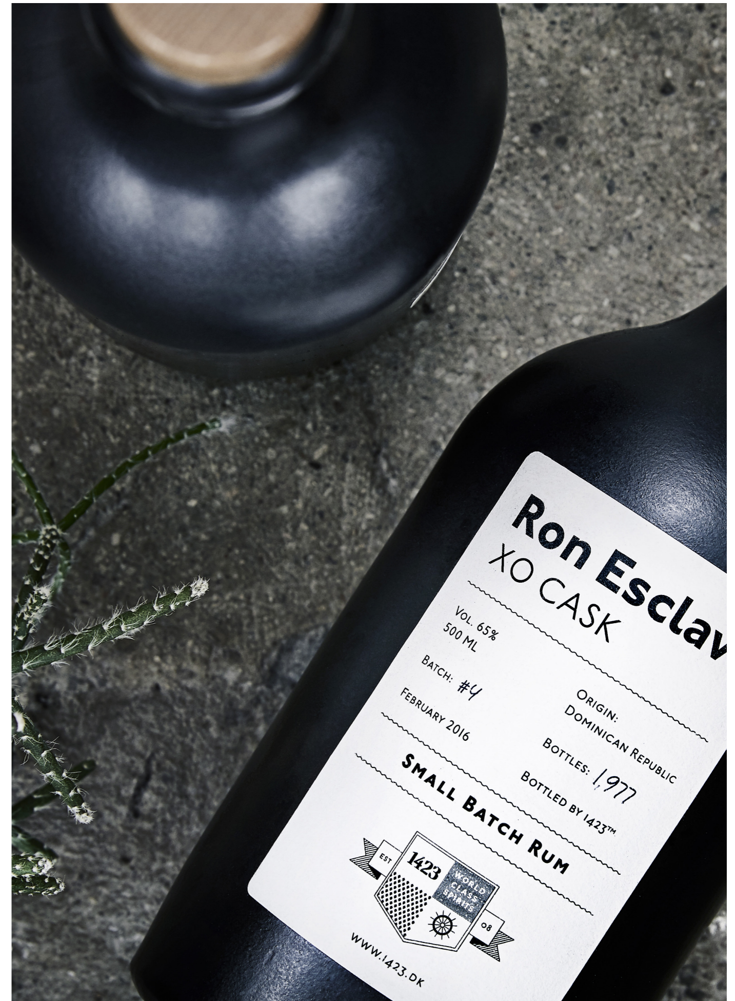
Ron Esclavo XO Cask from 1423

Ron Esclavo, “Slaves rum”, is a celebration of not the rum that slaves drank, but for the slaves who paid a high price for the rum to be widespread during its first years and to the ones who travelled and fought against slavery. To them we raise our glass. Ron Esclavo, from slavery to bravery!