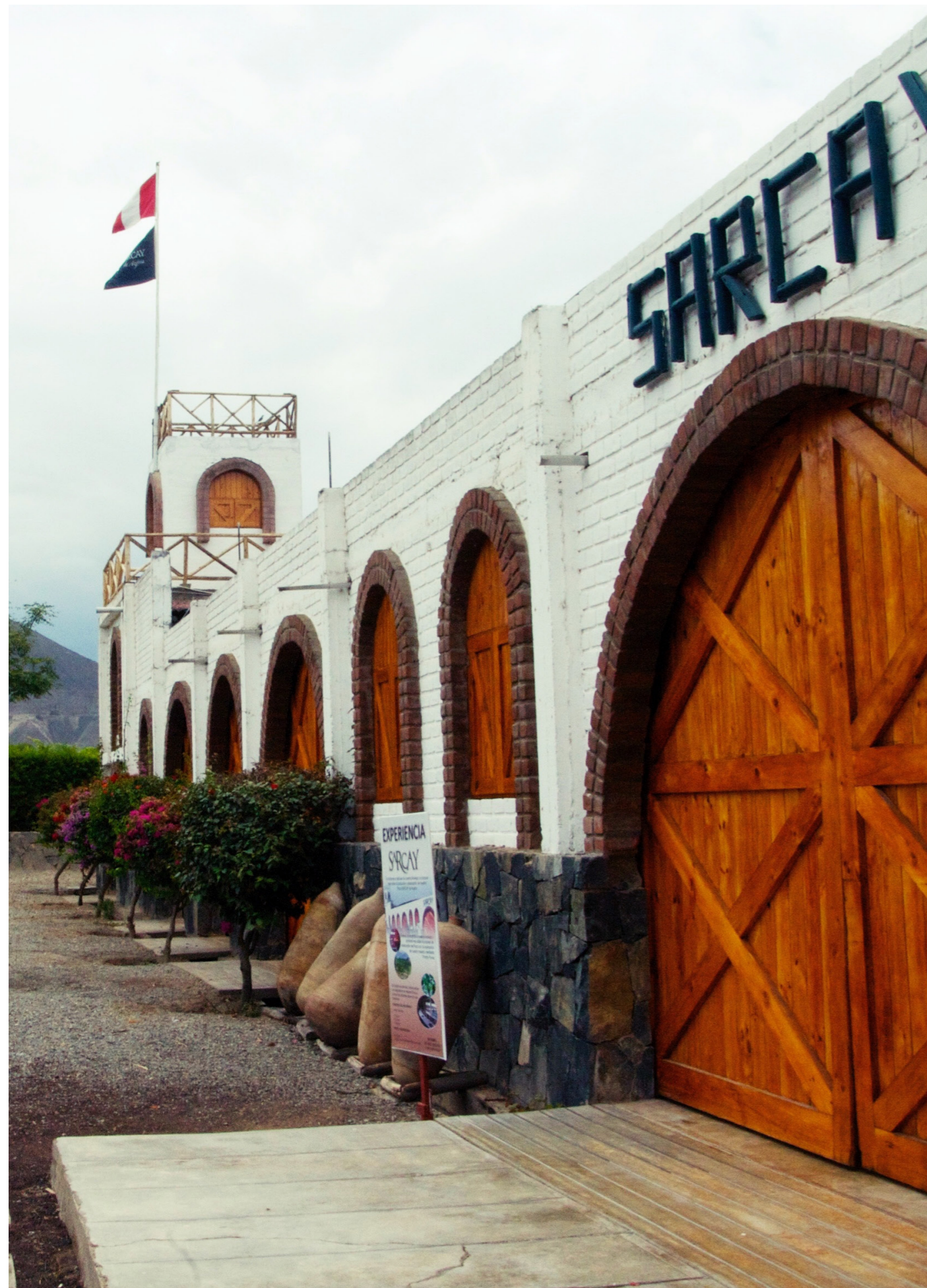
Sarcay de Azpitia