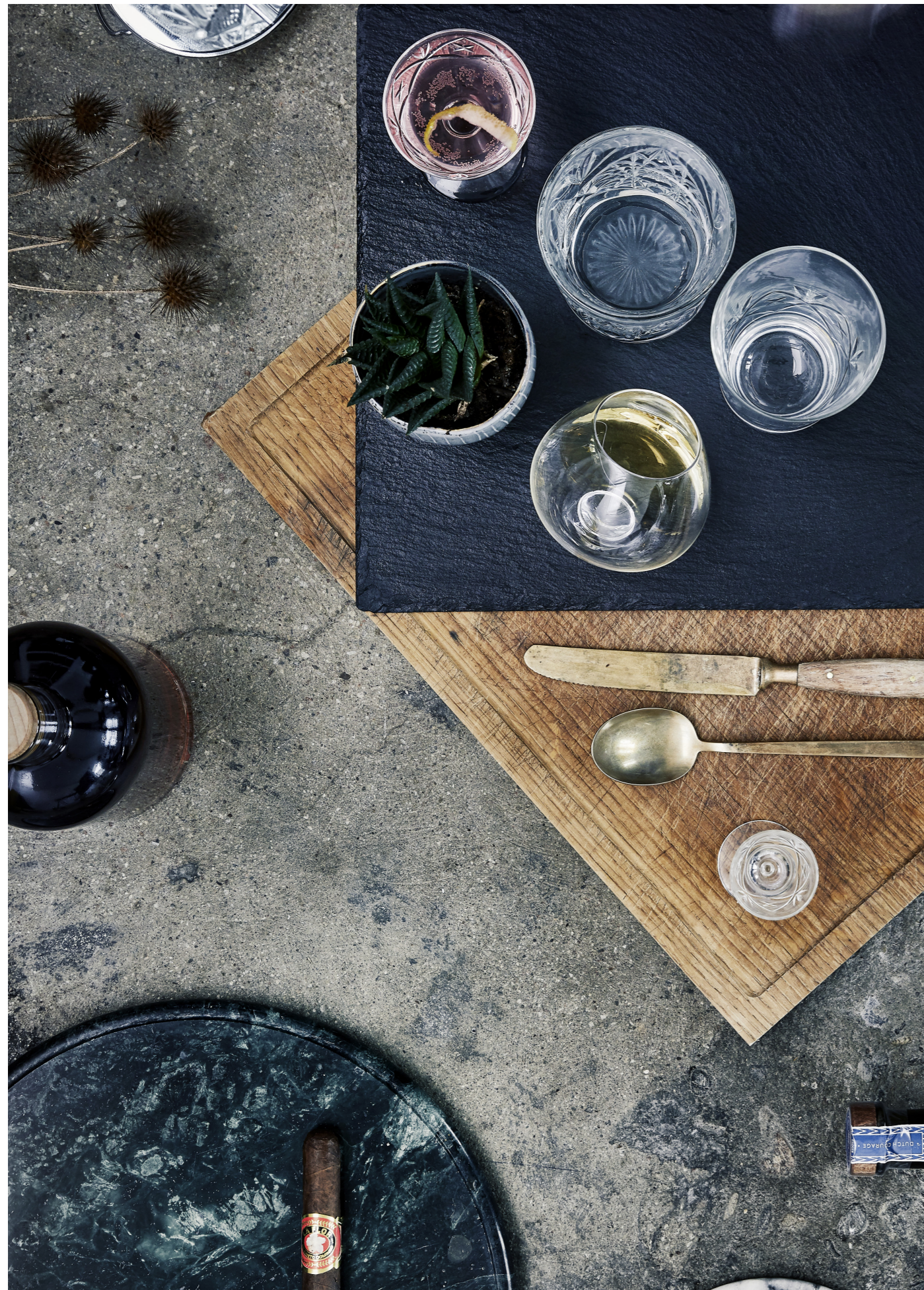
Behind the bar with 1423