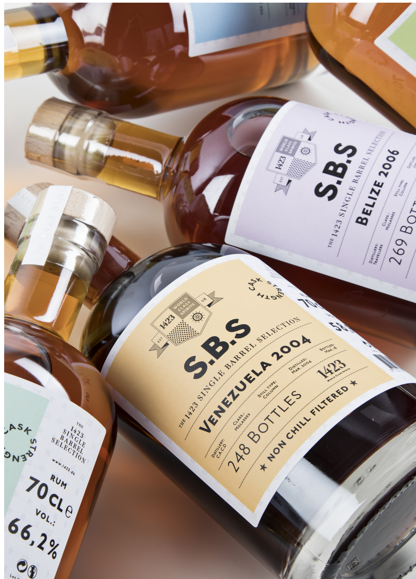
Single Barrel Selection from 1423