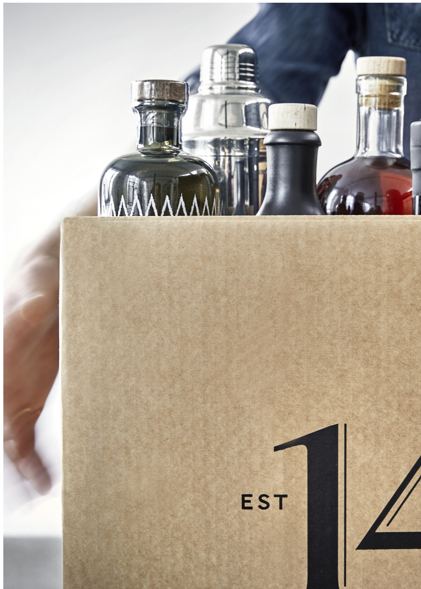
A mix of brands from 1423's assortment