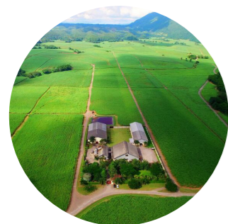
Worthy Park Estate in Jamaica